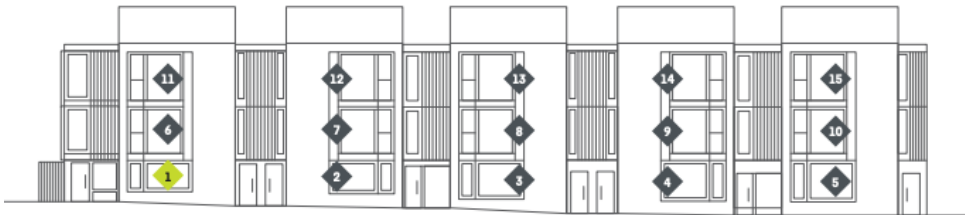
Apartment 1 | Ground Floor | 2 Bedroom | Total Gross Internal Floor Area: 58.6 sqm No. 14 New Street, Altrincham, WA14 2QS

Total floor measurements shown are typical for these apartment types but should not be relied on when ordering carpets or fittings. Please ensure you take your own measurements. Floorplans, layouts and measurements are subject to change.