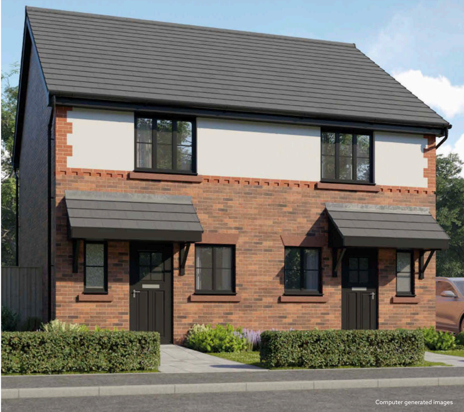
Computer generated images